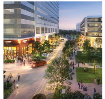
CityLine DFW - Richardson