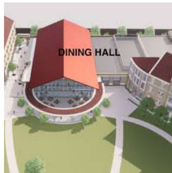
TCU - Fort Worth, TX