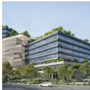
Corporate HQ - Dallas