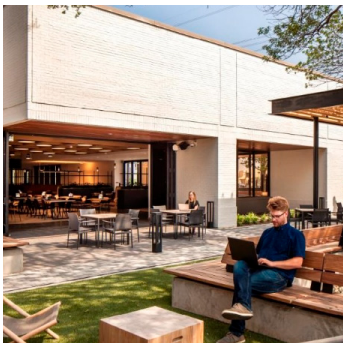
TIAA - Frisco, TX

Since starting in Dallas, Webb has reshaped dining in Dallas-Fort Worth and beyond, with key projects like KDC Cityline - State Farm in Richardson, TIAA in Frisco, and a leading financial institution in Dallas. We've also upgraded dining at TCU, showcasing our drive for innovation within campus environments.